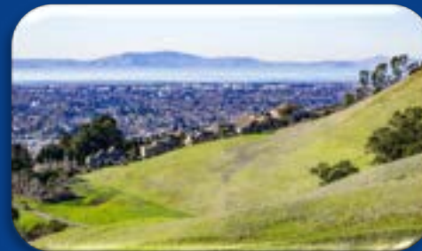
HAYWARD & SAN LEANDRO AUG 2024