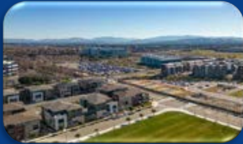
TRI-VALLEY FEB 2024

Launched in partnership with San Francisco Business Times, the East Bay Business News section and East Bay Hot Spots continued to highlight stories from our region's diverse economy