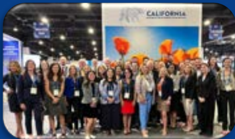
SELECTUSA SUMMIT JUN 2024

East Bay EDA supports opportunities to develop and expand foreign direct investment and other business opportunities among companies that seek to build or expand their import and export markets.