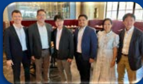
JETRO SAN FRANCISCO AUG 2024