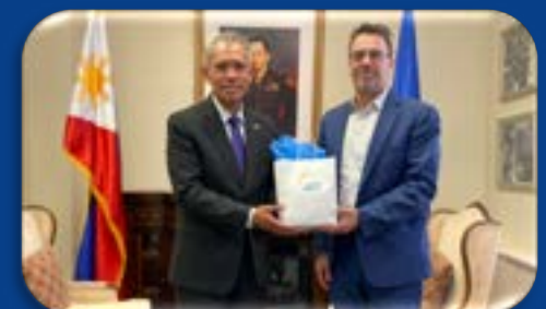
PHILIPPINE CONSULATE NOV 2024