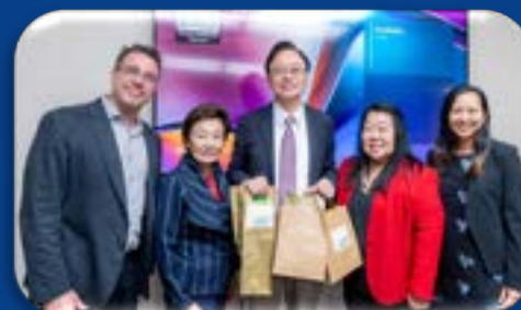
TAOYUAN, TAIWAN DELEGATION SEP 2024