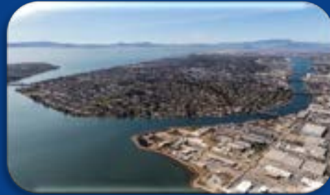
ALAMEDA MAY 2024