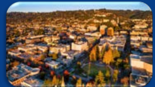
BERKELEY & EMERYVILLE OCT 2024